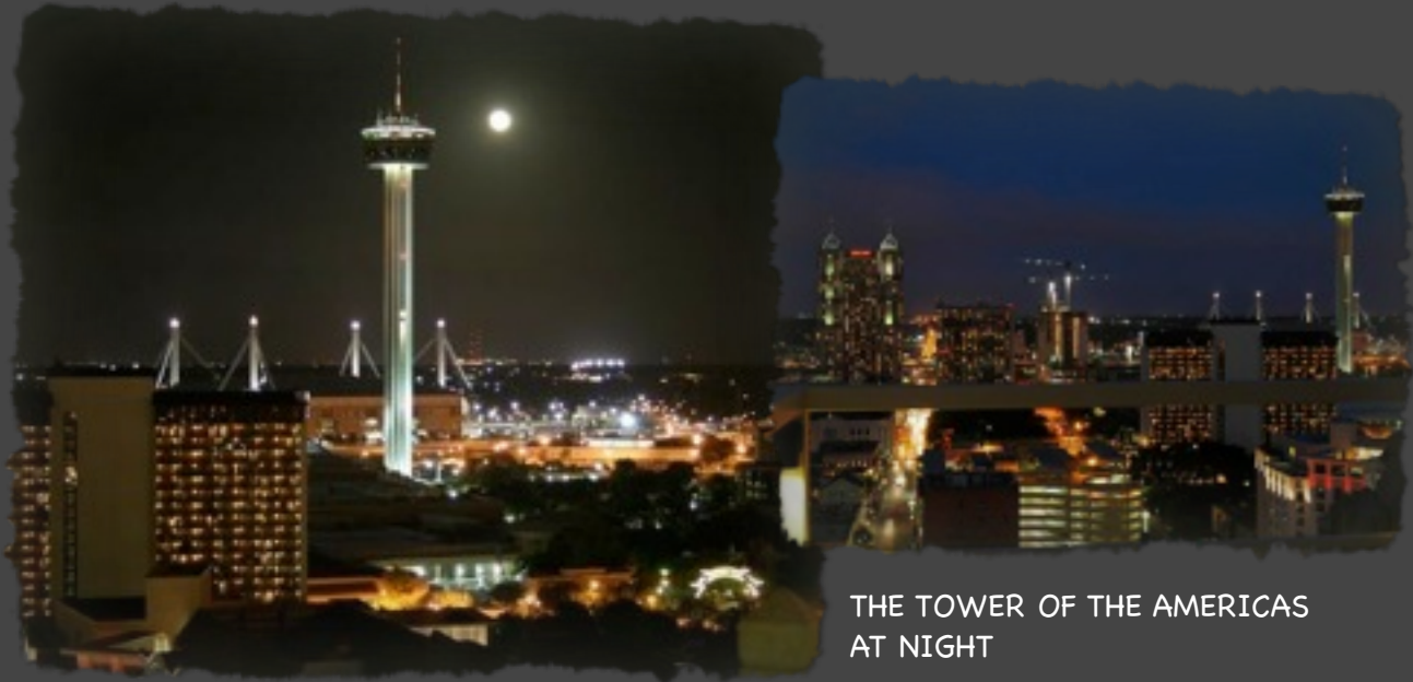
THE TOWER OF THE AMERICAS AT NIGHT